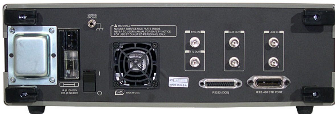
SR844 rear panel