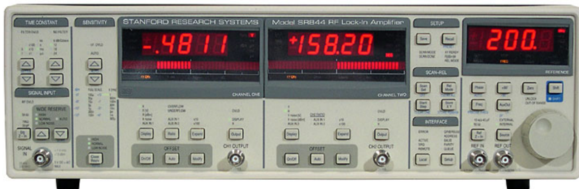
SR844 200 MHz Lock-In Amplifier

SR844 200 MHz dual-phase lock-in amplifier